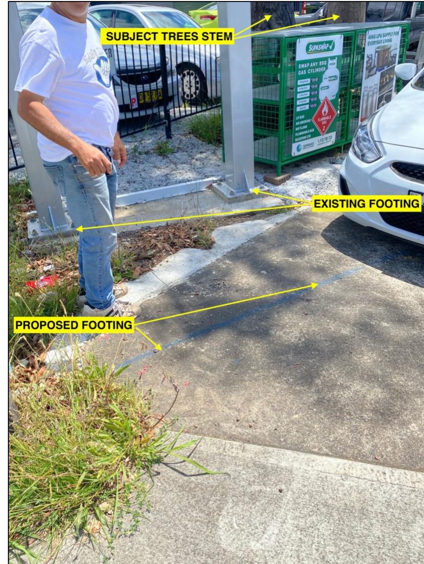
IMAGE 2: Proposed footings are in same radial spread but further away from tree stems than the existing footings (N. Maynard 08/11/22).