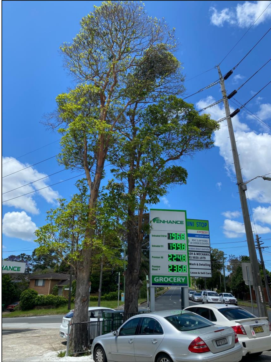
IMAGE 1: Subject trees growing in close proximity to the 'fuel pricing sign' (N. Maynard 08/11/22).